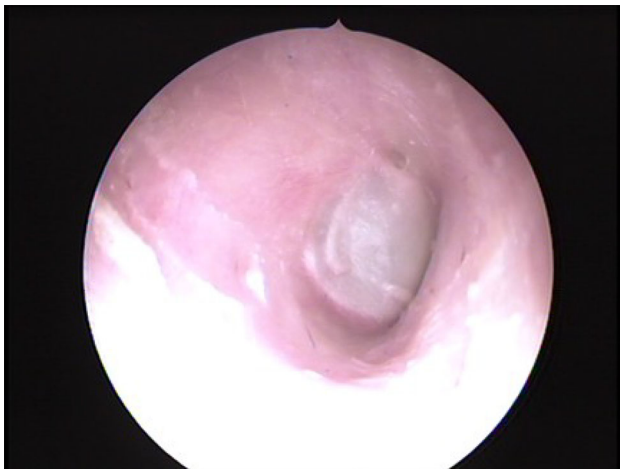
Fig. 3 Six months post-operative result showing intact tympanic membrane