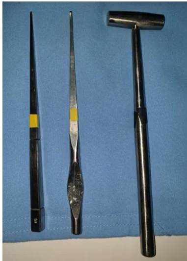
Fig. 1 Dr Ahila's Endoscopic Ear Chisel 1 mm, 2 mm and Mallet

Dr Ahila's Endoscopic Ear Surgery Chisel is straight 1 mm, 2 mm instrument used with a mallet primarily for