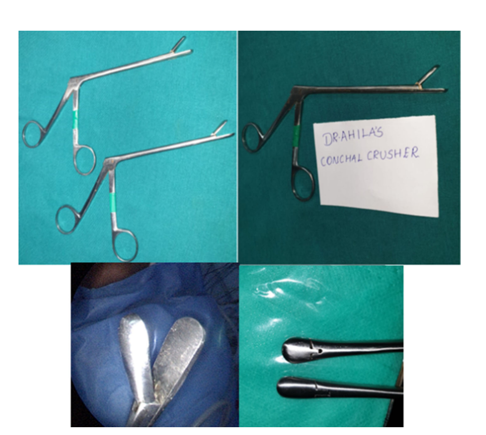
Fig. 1 Dr. Ahila's Conchal Crusher Instrument

Several cases were operated with this device over more than 2 years (2017 to 2019); senior author has also trained many colleagues and also demonstrated the application of Dr. Ahila's conchal crusher in live Endoscopic sinus surgery in India and Abroad without any complications or postoperative healing complications.