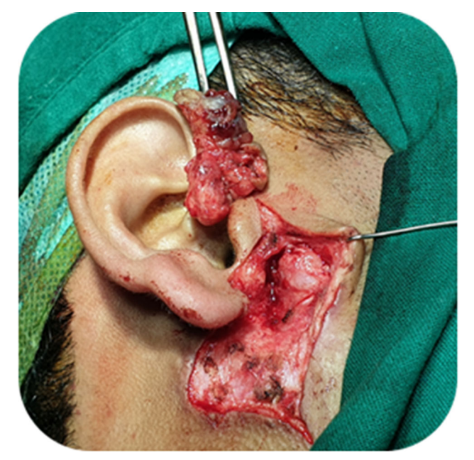
Fig. 3 Dissection of infra tragal sinus

layers after adequately securing hemostasis, no surgical drain was kept.