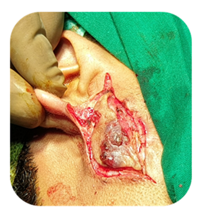
Fig. 2 Infra-auricular approach, elliptical incision given around the sinus site

The infra tragal sinus tract and the cyst were totally removed (Fig. 3). The operated site wound was closed in